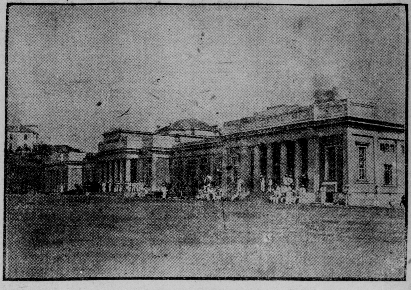
MAIN BUILDING AT THE NAVAL TRAINING SCHOOL.

One of the most interesting institutions in California is located on Goat island, in San Francisco bay, and although hundreds of thousands of people view it every month from the passing ferry steamers, few of them visit it, although entitled to the privilege. It is the United States naval training school, where several hundred sturdy lads are being housed, fed, educated and fitted for many branches in the American navy. They are all American boys, for Uncle Sam is lending aid to the plan to secure the youth of his own land to man his ships of war. The youngsters are enlisted into service. with the consent of parents or guardians, when 15 or 16 years old, and re-