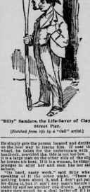
"Wong" sends the life-saver of...