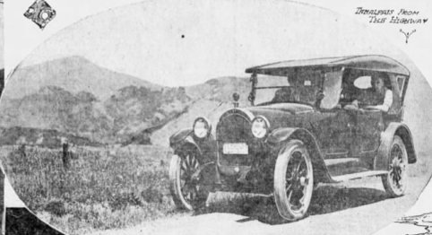
EXAMINER FROM THE HIGHWAY