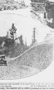
THE OLD CLIFF DRIVE

1. This new route interestingly follows the old route about the city's Cliff Drive—commonly referred to as the Cliff Drive—has been replaced in the heart of the city, where it has long been a danger to many lives. 2. The new route is 1.5 miles long. 3. It is 100 feet wide. 4. It is 100 feet wide. 5. It is 100 feet wide. 6. It is 100 feet wide. 7. It is 100 feet wide. 8. It is 100 feet wide. 9. It is 100 feet wide. 10. It is 100 feet wide.