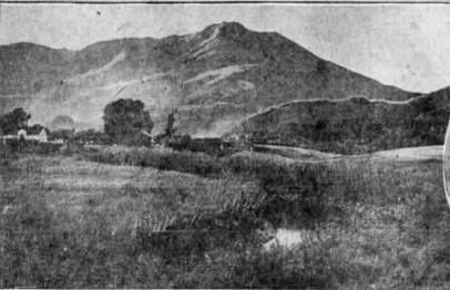
TAMALPAIS FROM THE PLATE

One of the most scenic motor highways in the world will soon be opened to travel from the shoulders of Mt. Tamalpais to the summit. From the vantage places along this route a wonderful panorama extends, with the ocean beach on the western slopes and San Francisco Bay and the rolling hills of the mainland on the east. The new road is expected to be opened throughout by July 4, and its construction eliminates dangerous curves and the usual narrow winding mountain grades. Over the proposed route "The Examiner" motorlogue car, an Oldsmobile Four from J. W. Leavitt & Co., went last week. The map of the present and proposed lines of travel was drawn by V. Nahl.