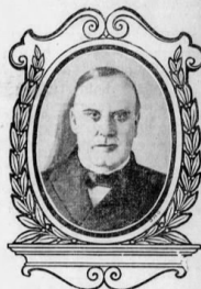
President William McKinley.

WILL William McKinley be the first President to obtain a third term? Chauncey M. Depew, United States Senator from New York, representative of the Kings of finance and of railroad matters, and a close friend of the President, has queried "Why not?" "McKinley has no enemies," he has said, and he questions the advisability of trying a "new man," when the old one has done well. Mr. Depew's statement has excited much comment throughout the country.