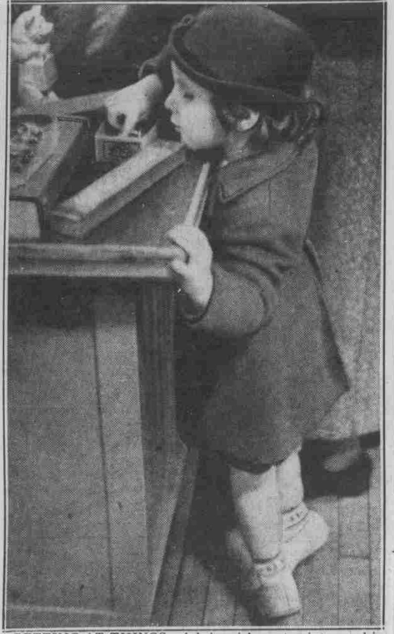
GETTING AT THINGS-A baby girl was too interested in Christmas decorations to pay attention to the spying candid camera as it caught her fingers investigating a box.