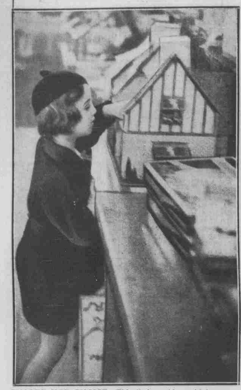
CHALET HER CHOICE-This little maid would have a model house, if Kris Kringle pays attention to her picture taken yesterday in a downtown San Francisco store.

CHILDREN'S FANCIES ARE STIRRED BY MINIATURE CARS, HOMES