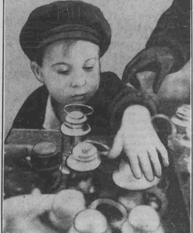
LET THERE BE LIGHT-A toy ship's lantern intrigues the little fellow pictured as he reached over the counter of one store yesterday during the Yuletide buying rush.