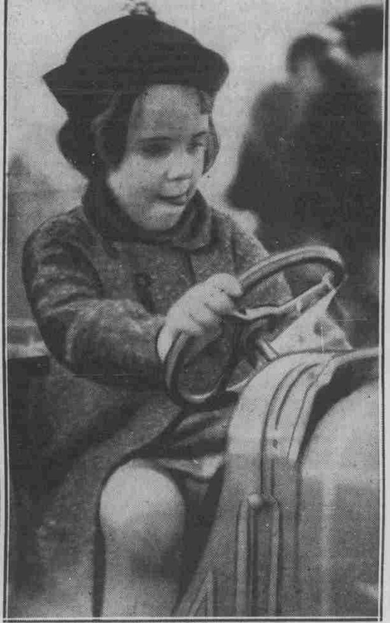
WHAT ABOUT A RUNABOUT?-That's the question another young lady of tender years proposes, for the one shown here is just her size, and she's ready to accept it, too!