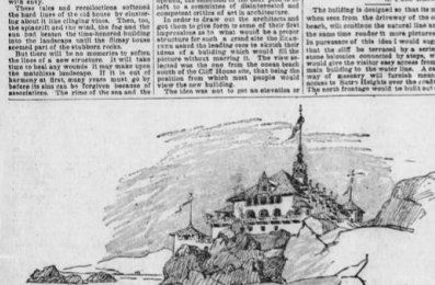
WILLIS POLK'S DESIGN FOR NEW CLIFF HOUSE THAT WOULD NOT PROTECT THE SEA.