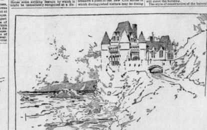
WHAT ARCHITECT CONRAD THINGS WOULD LOOK WELL AMID THE BREAKING WAVES.

It is a question of the Cliff House, and the question is, what kind of a structure will Suptro erect on the ruins of the Cliff House?