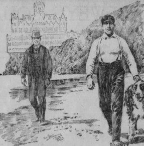
TOM SHARKEY ON THE OCEAN BEACH HE LOVES SO WELL.

From Sharkey's perspective as a pugilist, he is a confident man. He has a good record and is expected to win by a good margin. He is confident that he can beat any man in the world.