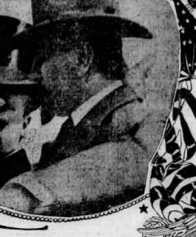
NAVY SECRETARY AND THE PRESIDENT IN THE CARRIAGE DURING THE PARADE.

The programme for today includes a visit to the Golden Gate and a luncheon at the Hotel. The President will leave for the Golden Gate at 10 o'clock. He will return at 12 o'clock. A luncheon will be given at the Hotel at 1 o'clock. The President will then visit the Golden Gate. He will return at 4 o'clock. A luncheon will be given at the Hotel at 5 o'clock. The President will then visit the Golden Gate. He will return at 8 o'clock. A luncheon will be given at the Hotel at 9 o'clock. The President will then visit the Golden Gate. He will return at 11 o'clock. A luncheon will be given at the Hotel at 12 o'clock.