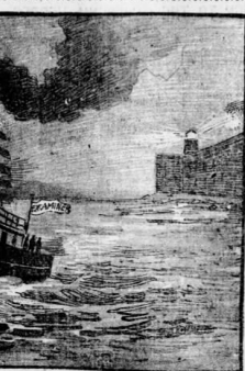
TUG SEA KING ON HER WAY TO THE SHERMAN WITH MAIL FOR THE BOYS.

At last the expected Spanish steamer, "The Sherman," sailing yesterday told the waiting officers that the steamer had been sighted—that the California boys were knocking at the door of home. "The Sherman" saluted into the air and gave in reply, the aid came that one glad message for which every heart was waiting—"The boys have come back!" All eyes were turned to the sea and there the Sherman was seen with her searchlight on the water. The ship was not far from the city and the searchlight of the Sherman was turned on the water. The searchlight of the Sherman was turned on the water. The searchlight of the Sherman was turned on the water.