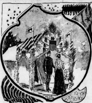
COLONEL DUBOCE'S DECORATED TENT AT THE PRESIDIO.

FLOWERS AND FLAGS DECK THE TENT OF COLONEL DUBOCE AT THE PRESIDIO